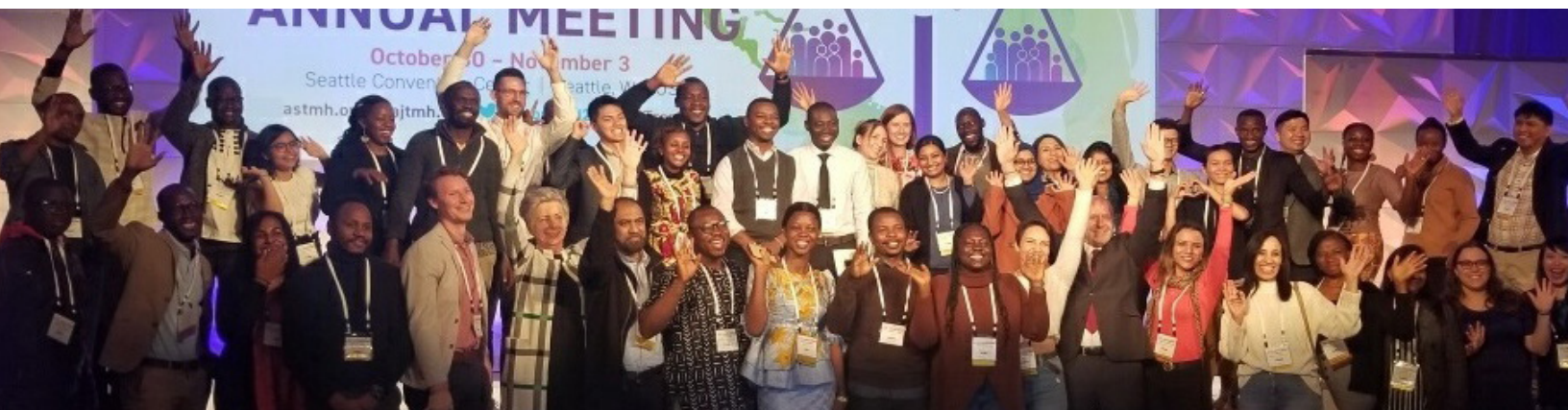
2022 ASTMH/BMGF Travel Award Recipients (not all recipients present)