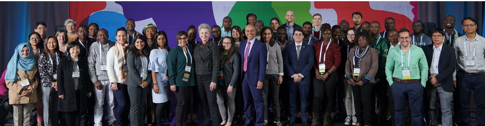
2019 ASTMH/BMGF Travel Award Recipients (not all recipients present)

The American Society of Tropical Medicine and Hygiene (ASTMH) offers Travel Awards to qualified students, early career investigators and scientists actively working in the tropical medicine field to attend the Society's Annual Meeting. These awards facilitate participation for those who might not otherwise be able to attend. Selected recipients will enhance the overall scientific quality and learning potential of the meeting through their oral and poster presentations.