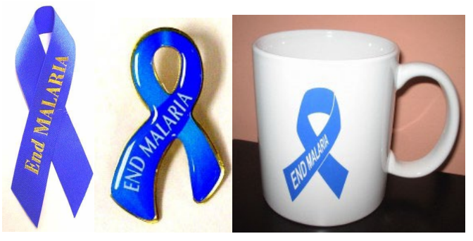
Page 1 of 2 <u>PR.com Press Release Distribution</u> <u>Terms</u>