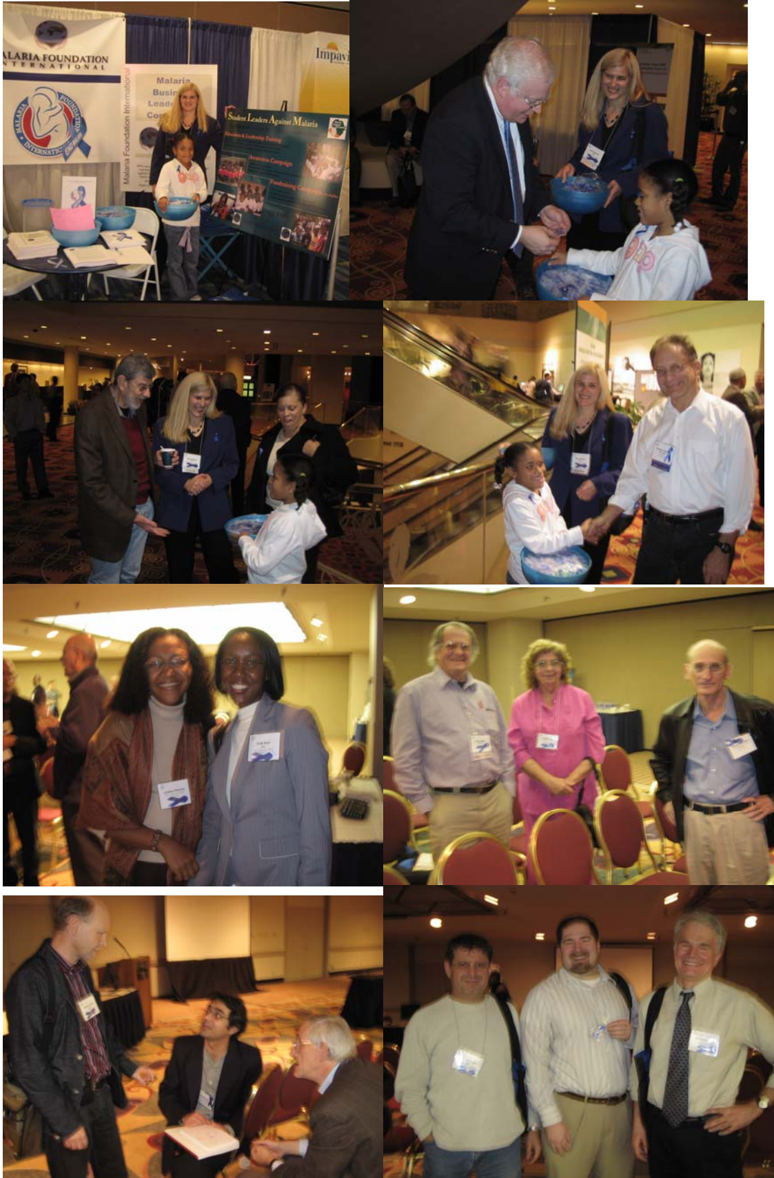
55 th Annual American Society of Tropical Medicine & Hygiene Meeting (ASTMH) Atlanta, GA, USA