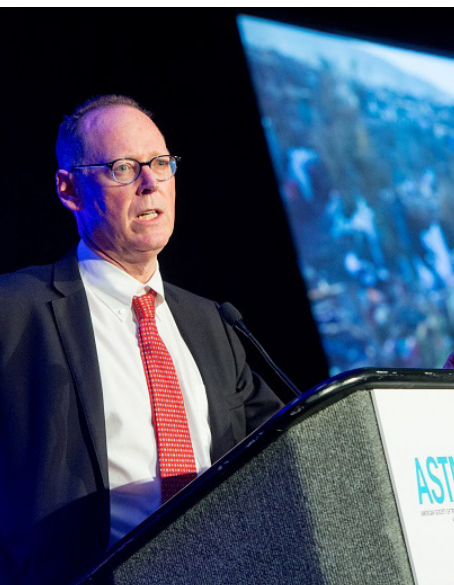
Paul Farmer, MD, PhD