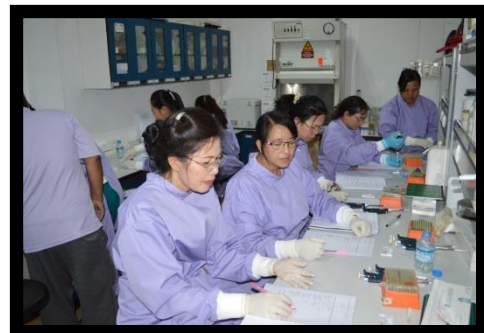
Lao Medical Laboratory Scientists learning to diagnose dengue and NTDs, Vietnam

ACAV needs your help to provide information of importance to the membership. This newsletter will have sections for positions available (faculty, post-doctoral fellows, training opportunities, etc.), books of interest, updates on meetings, and anything relevant to the modern arbovirologist. We need you to send items (and really need pictures!) that should be shared. If you are creative and want to put your artistic talent to use for ACAV, we are looking for a new logo. The design will be part of our website, newsletter, and any future items ACAV may generate. If you have material you'd like included in the next edition of the newsletter, please send it to SIE ( apowers@cdc.gov ) or any ACAV council member.